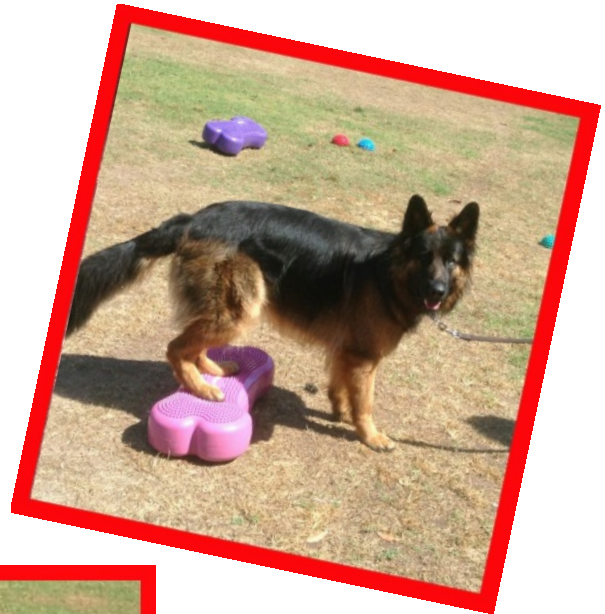
Balance & Stretch