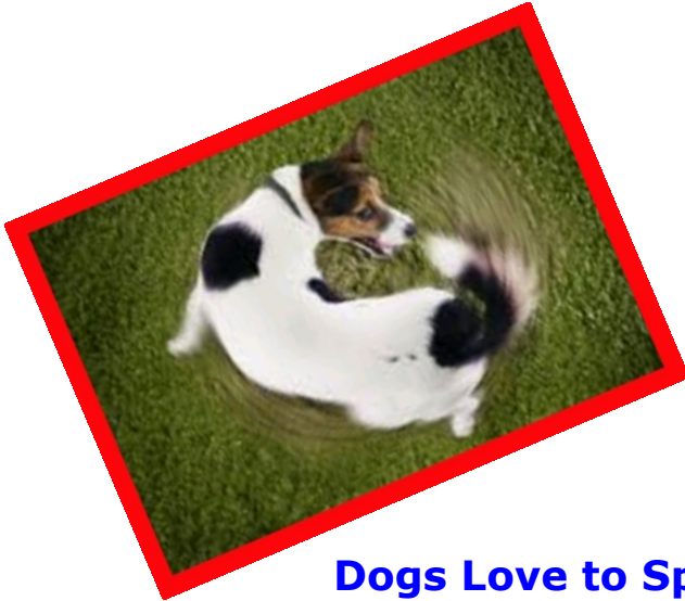
Dogs Love to Spin

We don't just teach formal obedience in our classes. We want your dogs to enjoy, learn and have fun so we teach focus exercises, games, tricks as well as balance and stretching exercises