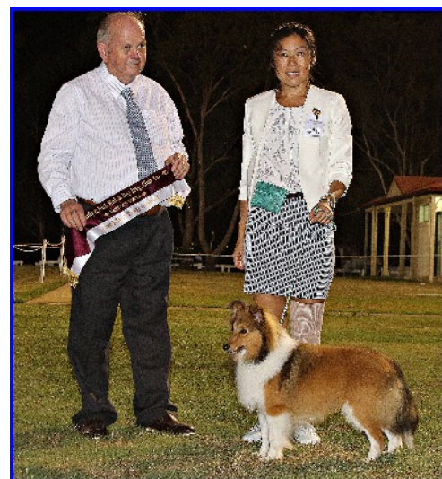
Shetland Sheepdog Herdsman Little Larrikin