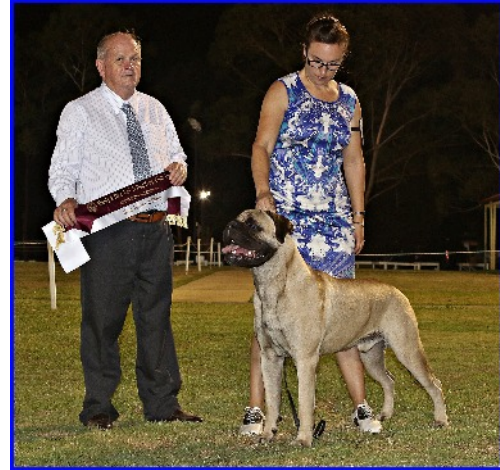
Bulmastiff Gameguard Power of One