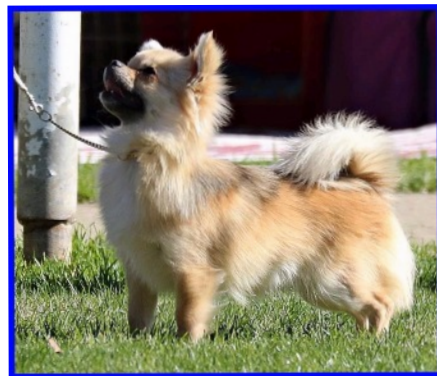
Chihuahua Long Coat Ch Sparklchi Grand Finale