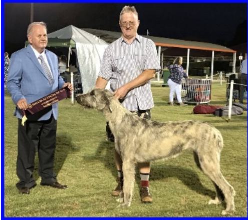
Irish Wolfhound Wulfgar Freya