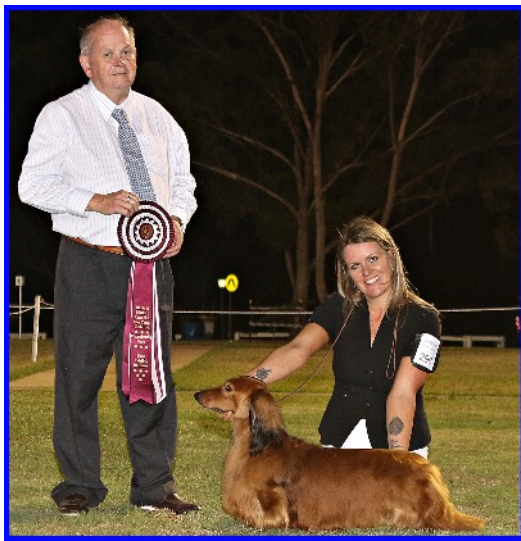
Dachshund Std Long Haired Sup Ch Charlmagne Jimmy Choo