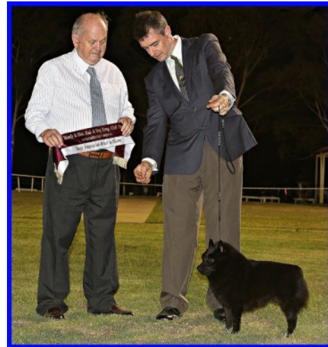
Skipperke Ch Monterrez Power and Might