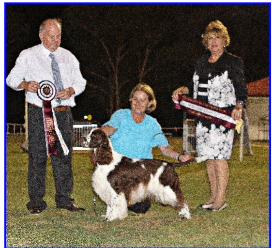
English Springer Spaniel Sup Ch Reibey World Premiere