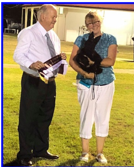
N Scottish Terrier Bescotted Legend of Zorro