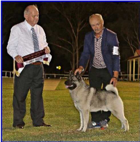
Elkhound Ch GRabine Little Bit o Chilli